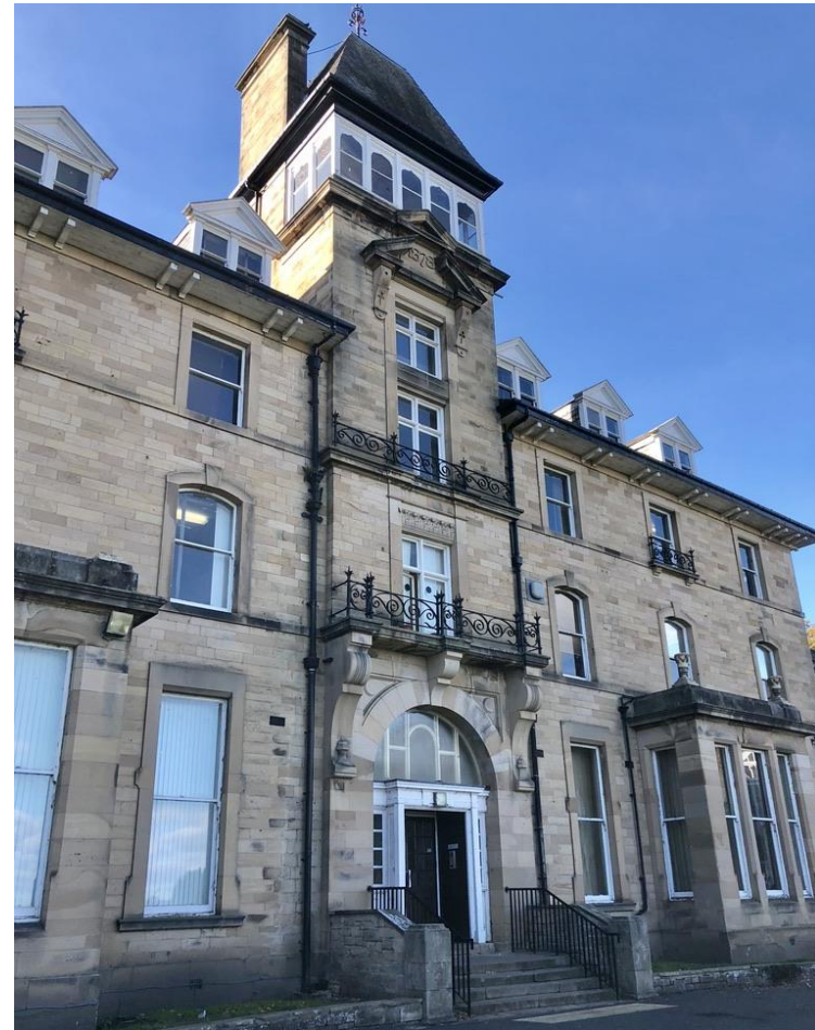
Grade II listed Hydro building on the QEHS site, which would be retained and refurbished.

We are keen to hear the views of as many of you as possible. Please complete the online Response Form to help minimise administration costs.